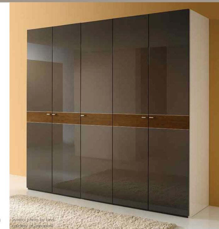
Symbol photo by kind courtesy of Senoplast