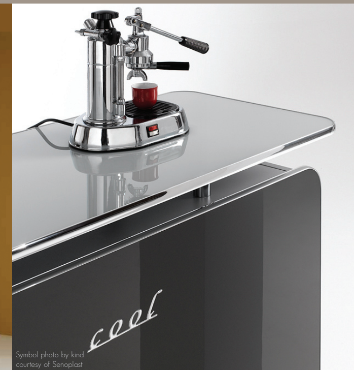
Symbol photo by kind courtesy of Senoplast