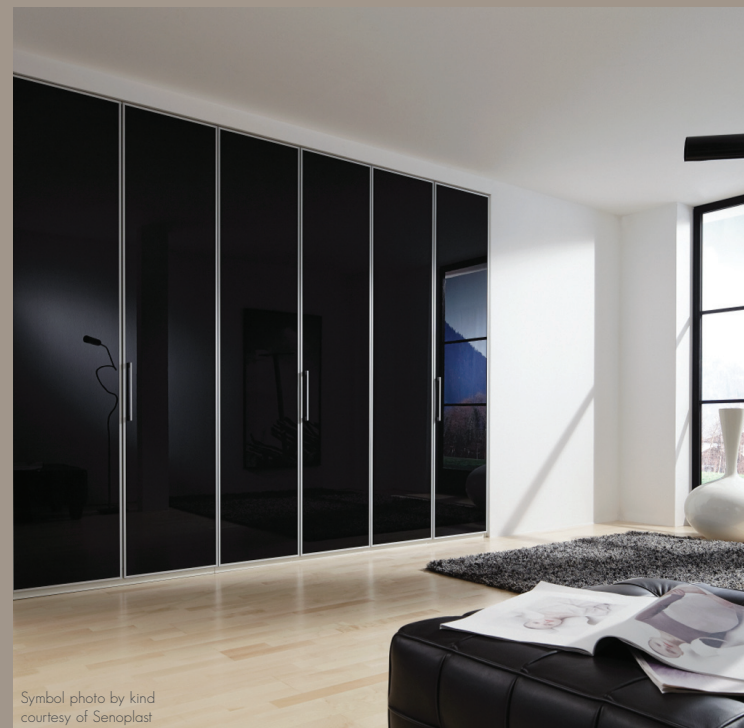
Symbol photo